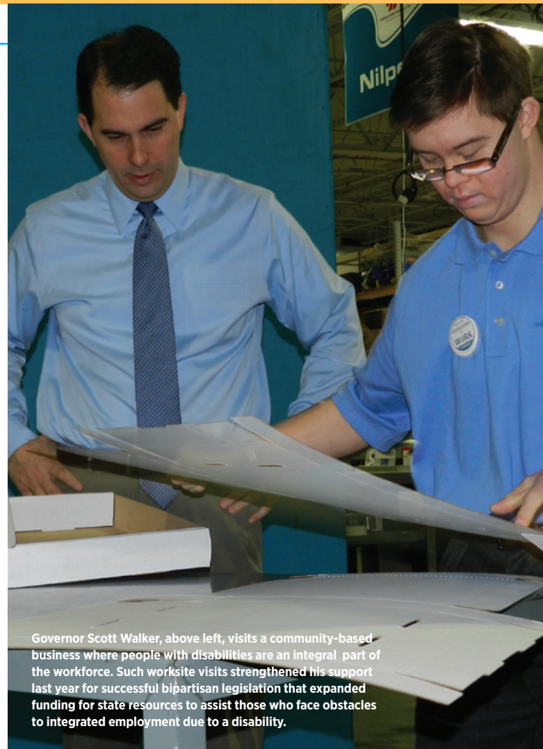
Governor Scott Walker, above left, visits a community-based business where people with disabilities are an integral part of the workforce. Such worksite visits strengthened his support last year for successful bipartisan legislation that expanded funding for state resources to assist those who face obstacles to integrated employment due to a disability.

Tenacious advocacy and a data-focused information campaign on the benefits of employment for people with disabilities were critical in persuading policymakers to take